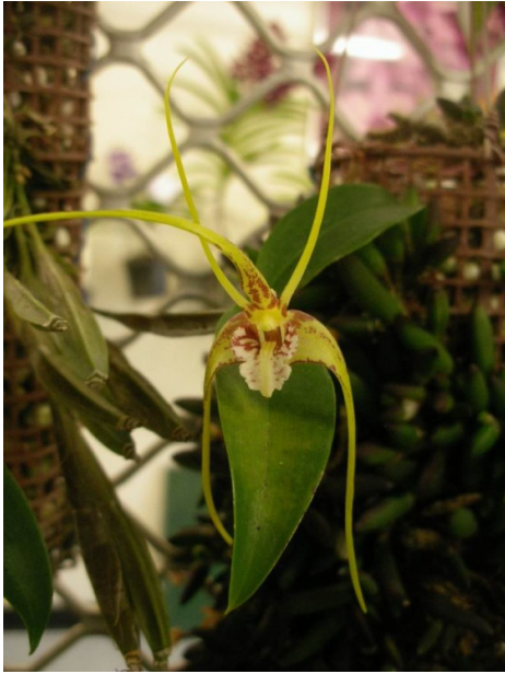
Dendrobium tetragonum (at the Townsville Orchid Society's Spring 2011 show.)

Many of these can be purchased at local orchid nurseries, TOS orchid shows and from local growers. Keep this list handy and when given the opportunity be sure to add these to your collection.