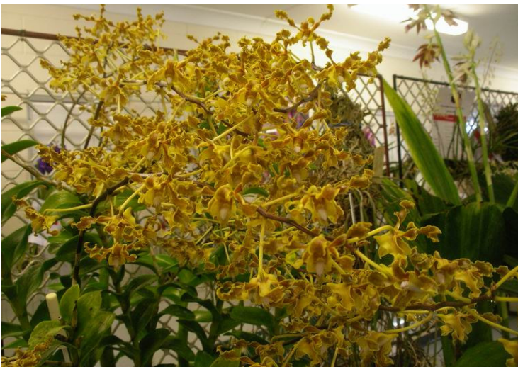
Dendrobium discolour (at the Townsville Orchid Society's Spring 2011 show.)

Dendrobium jonesii , Dendrobium speciosum , Dendrobium teretifolium , Dendrobium tetragonum , Dendrobium bowmanii , Dendrobium canaliculatum , Dendrobium monophyllum , Dendrobium linguiforme , Sarcochilus ceciliae , Cymbidium madidum , Dendrobium lichenastrum , Dendrobium discolour , Dendrobium X Grimesii , Dendrobium X Ruppiosum , and the terrestrial Nervilias and Habenarias .