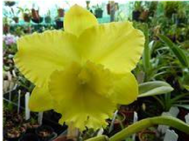
Rlc. Karen's Sunrise